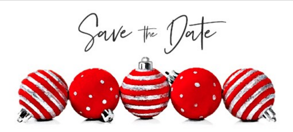
All Saints Annual Christmas Concert December 18, 2022 2:00 pm

That word above all earthly powers, No thanks to them, abideth; The Spirit and the gifts are ours Through Him who with us sideth: Let goods and kindred go, This mortal life also; The body they may kill: God's truth abideth still, His Kingdom is forever.