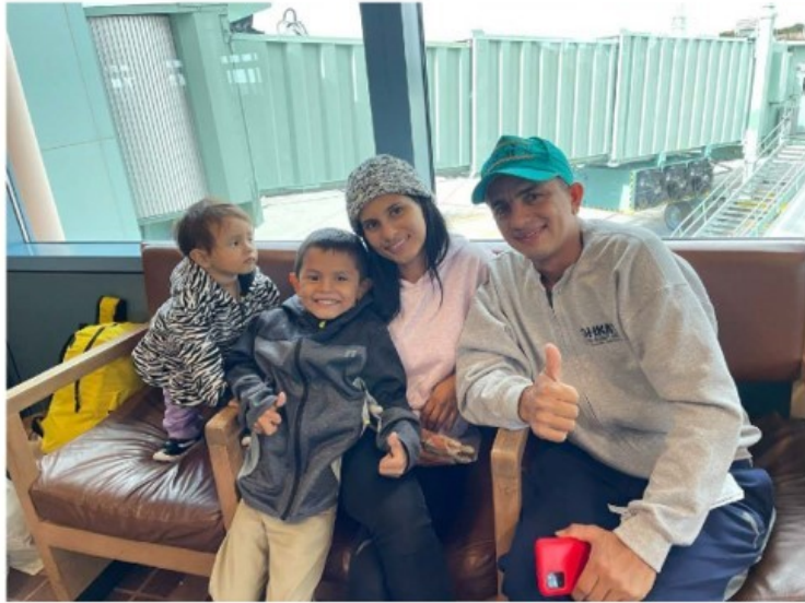
An asylum-seeking family waiting to board a plane to their sponsor. A thumb up and smiles reflect their relief, gratitude, and hope for the future.

The ABQ Asylum Seeker Welcome (AASW) wants to say thank you, thank you, thank you to the many friends who have donated money, clothing, and thousands of hours of volunteer time that allows us to be welcoming. We are wrapping up a full year of receiving asylum-seeking families. The need continues, and we will continue with your help.