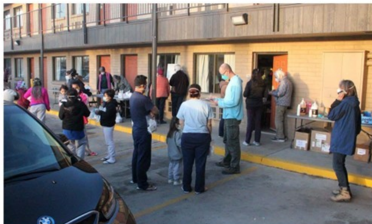
Tables of clothing & other goods for guests.

Initially, we welcomed a bus of families every other week. Now we receive families weekly, which means providing 50 pairs of shoes, 100 pairs of socks and underwear, warm clothing, hygiene products, backpacks, diapers, and coloring books every week. Gratefully, Second Presbyterian Church, at Lomas and Edith, donates space for our Donation Center. Each week our