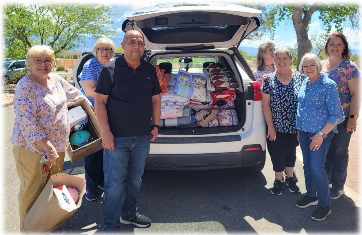
ALSC Quilters and their 2023 Donation to Lutheran Family Services

This shipping information is from LWR's 2022 fiscal year (Oct 2021 - Sept 2022).